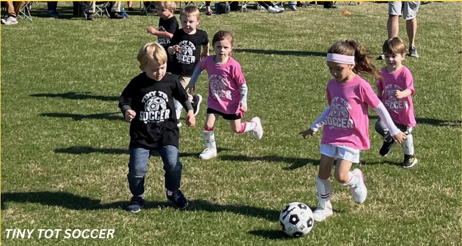
TINY TOT SOCCER