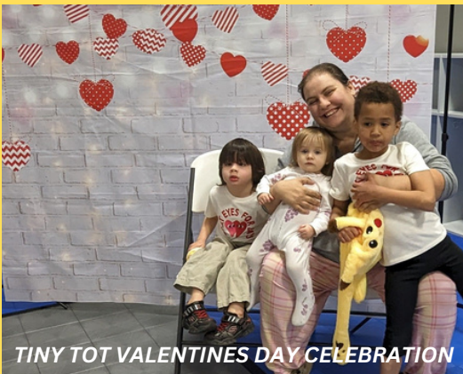
TINY TOT VALENTINES DAY CELEBRATION