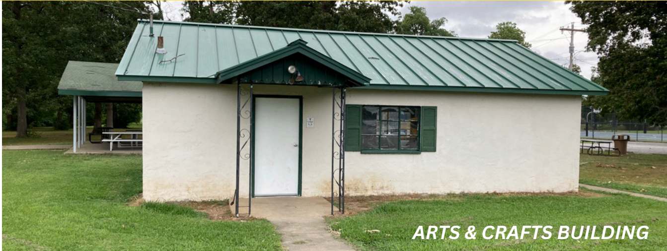
ARTS & CRAFTS BUILDING