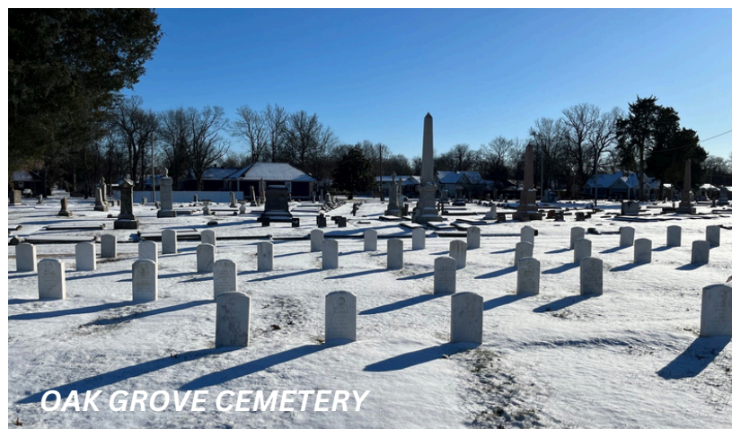
OAK GROVE CEMETERY