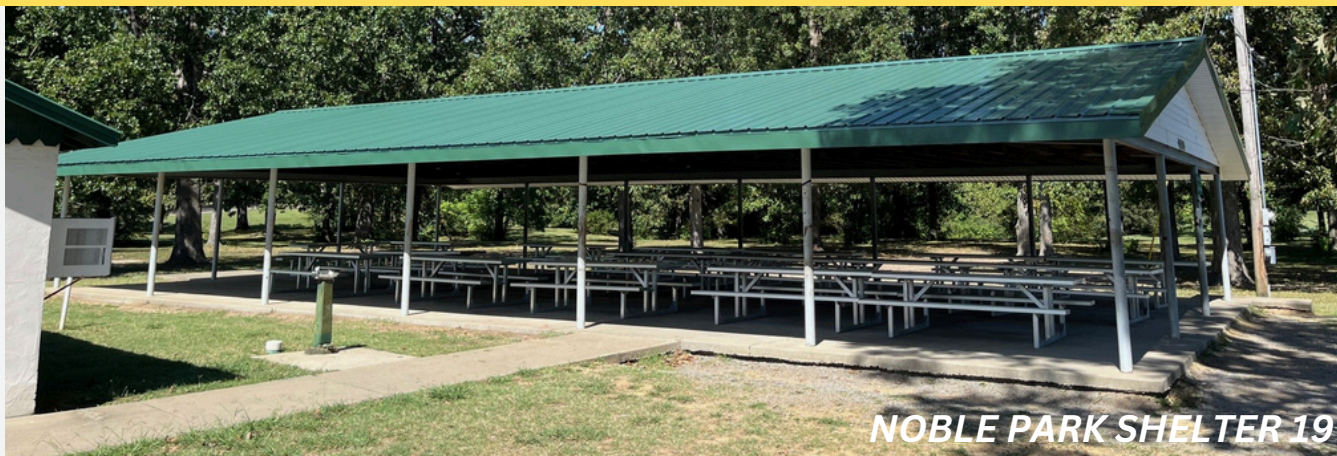
NOBLE PARK SHELTER 19