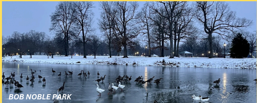
BOB NOBLE PARK